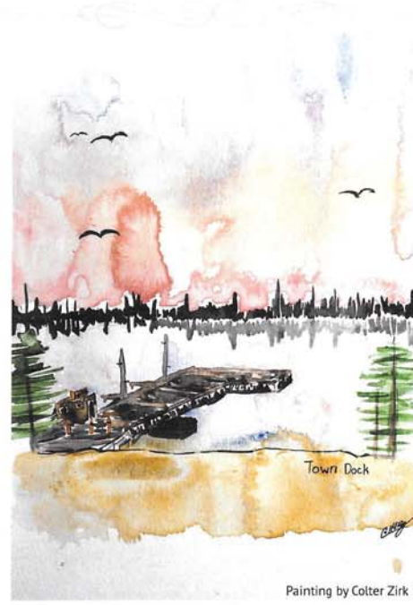
Painting by Cotter Zirk