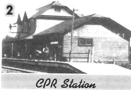
2 CPR Station