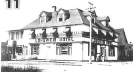
Old Lakeview Hotel