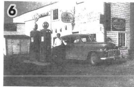
6 Augustine's Garage & Taxi Service