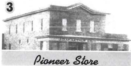
3 Pioneer Store