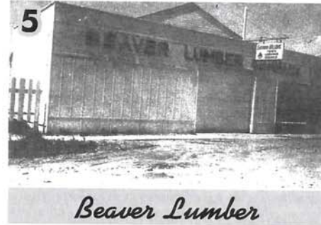
5 Beaver Lumber