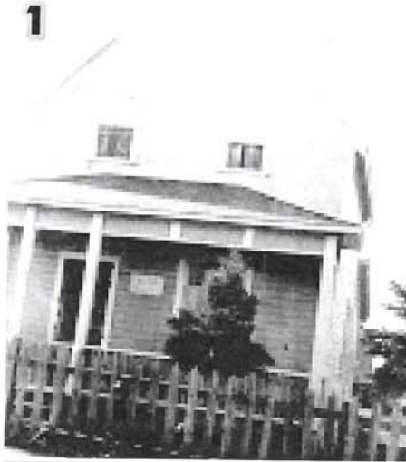
1 First RCMP Detachment Corner of McArthur Avenue & Second Street