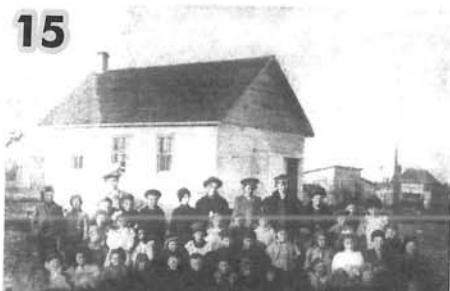
Park Avenue School