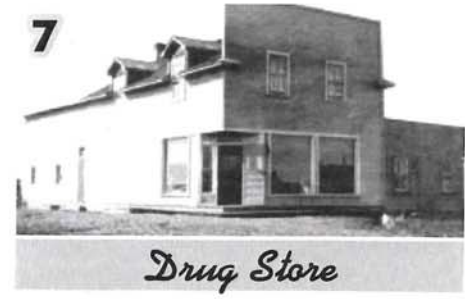
7 Drug Store