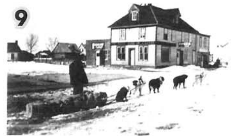
9 Allard Building Drug Store & Royal Bank Corner of Park Avenue & Third Street, north side