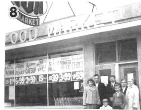
8 Roy's Food Market