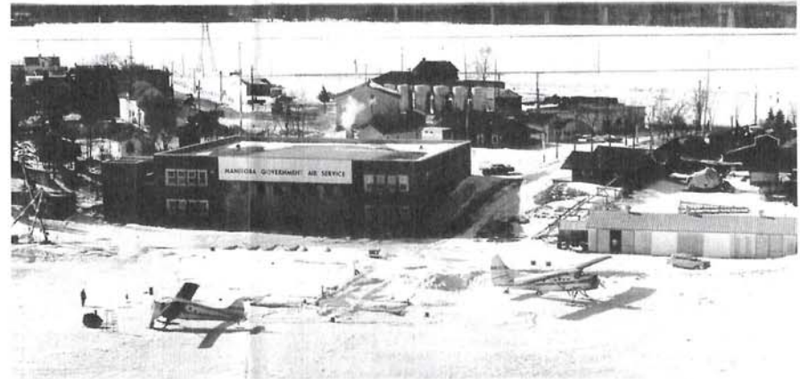
M.G.A.S. Headquarters Building, Beaver and Otter Aircraft in foreground. Background - C.P.R. Station and Imperial Oil Storage Tanks 1958.