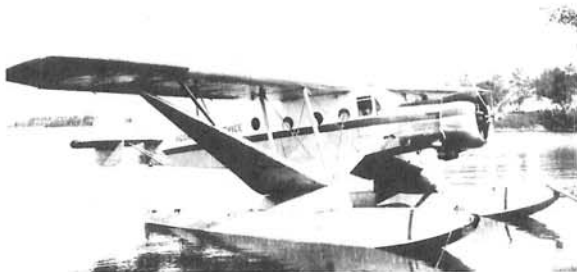
Bellanca Aircruiser CF-BTW, one of only 12 Built. Used extensively in Manitoba.

Throughout the following years other airlines followed the "Pioneers" in providing air service to the remote areas of Canada from the Lac du Bonnet Airport. They were A&V Air Service, Wendigo Wings, Air Park, Rotorways and Whiteshell Air Service. Today, Provincial Helicopters and