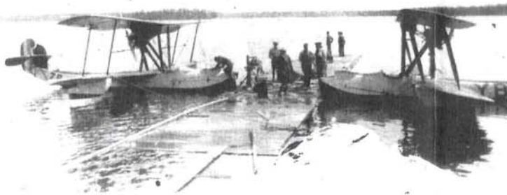
R.C.A.F. Vedettes at Lac du Bonnet 1930.

The first recorded use of Lac du Bonnet as a base of operations for an aircraft is July of 1922 when the Canadian Air Force (pre RCAF 1924) was conducting aerial survey work in the area. Western Canada Airways followed in 1926 and the RCAF in 1927.