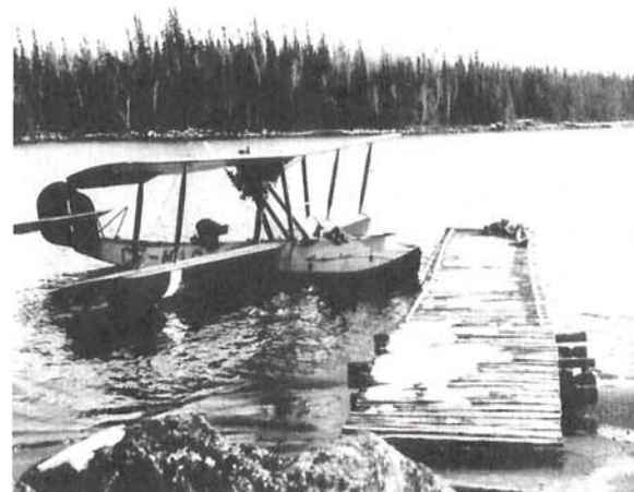
M.G.A.S. Vickers Vedette CF-MAC used on Forest Fire Patrol 1932-1937. Last Vedette to operate in Manitoba.