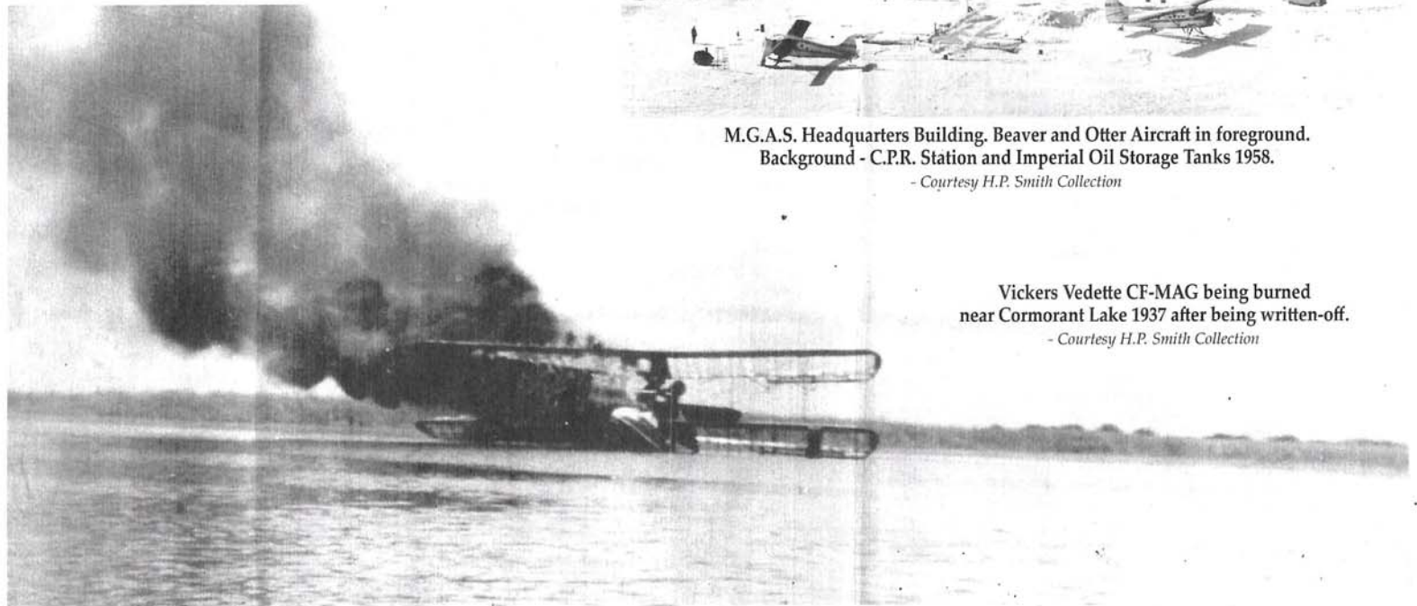
Vickers Vedette CF-MAG being burned near Cormorant Lake 1937 after being written-off.